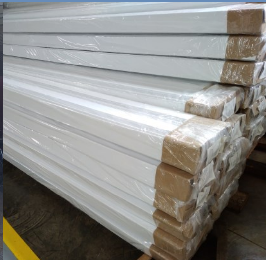
Negotiations are under way with the supplier of gutters asking them to stop using plastic as packaging and replacing it with an eco-friendly alternative.