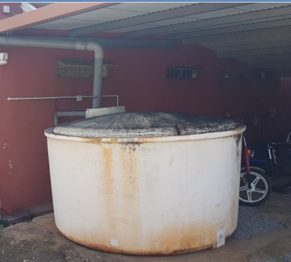
All toilets are now connected to a 5000 L rain water tank since December 2019 resulting in savings of more than 600 L of potable water per day.