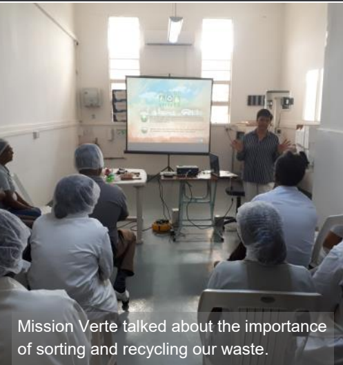
Mission Verte talked about the importance of sorting and recycling our waste.