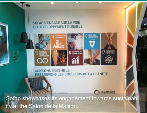
Sofap showcases its engagement towards sustainability at the Salon de la Maison.