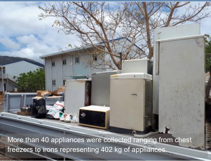
More than 40 appliances were collected ranging from chest freezers to irons representing 402 kg of appliances.