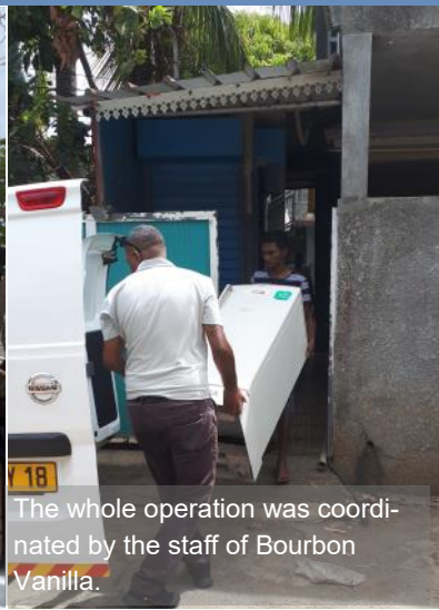
The whole operation was coordinated by the staff of Bourbon Vanilla.