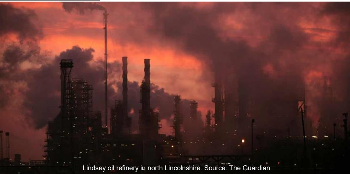
Lindsey oil refinery in north Lincolnshire.

New data from world-renowned researchers reveals how this cohort of state-owned and multinational firms are driving the climate emergency that threatens the future of humanity, and details how they have continued to expand their operations despite being aware of the industry's devastating impact on the planet.