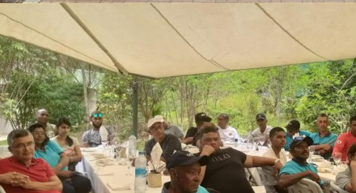
After lunch, the GM and champion of Water Research & GETS as well as the Sustainability Manager briefed the employees about the United Nations Sustainable Development Goals.