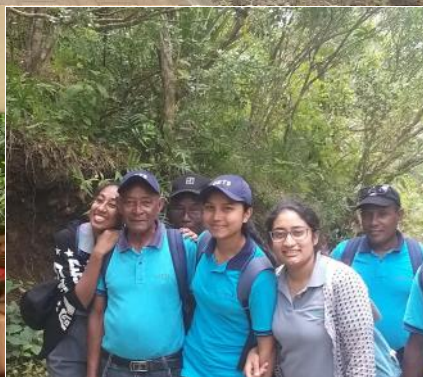
The staff enjoyed a walk in the forest where 6 of 9 endemic birds can be seen.