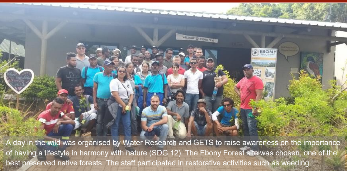
A day in the wild was organised by Water Research and GETS to raise awareness on the importance of having a lifestyle in harmony with nature (SDG 12). The Ebony Forest site was chosen, one of the best preserved native forests. The staff participated in restorative activities such as weeding.