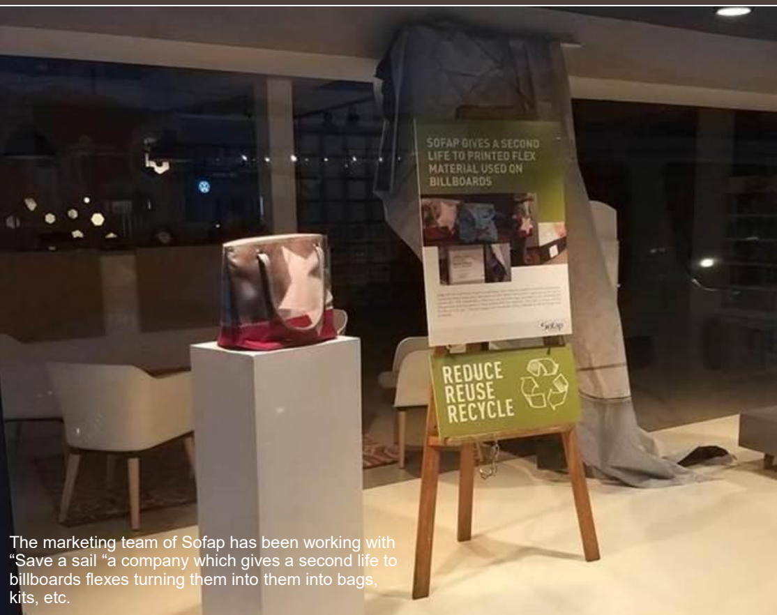
The marketing team of Sofap has been working with "Save a sail" a company which gives a second life to billboard flexes turning them into them into bags, kits, etc.