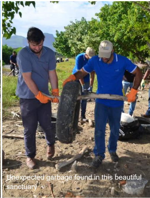
The operation was organised by TS Technical in collaboration with their neighbours—TS Boatyard, TS Equipment, TS Marine and Aqua Science