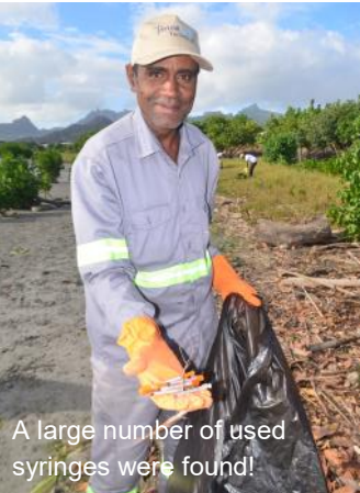
A large number of used syringes were found!