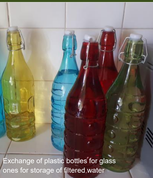
Exchange of plastic bottles for glass ones for storage of filtered water