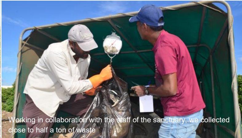
Working in collaboration with the staff of the sanctuary, we collected close to half a ton of waste